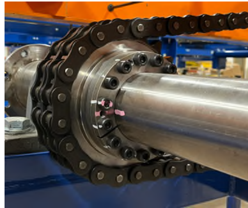
▲ Close up of the drive sprocket.

Typically, the 2-position eccentric lift table or hold table is mounted between the two belts of the cross-transfer conveyor. The lift table descends to its lowest position to accept the transported goods, so that the cross-transfer conveyor can place the skid above the power roller bed on the lift table.