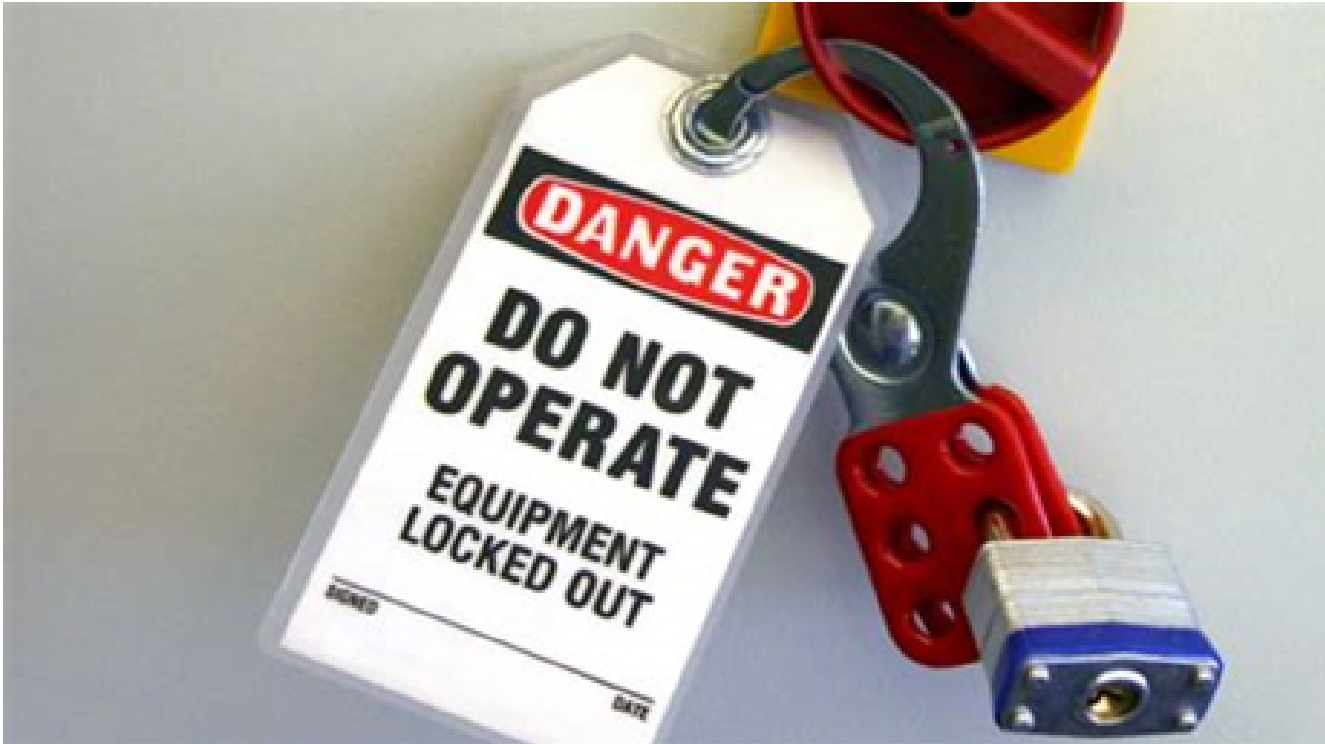
▲ Typical Lockout Tag

Safety should be a primary concern for all personnel working in an industrial environment. Industrial machinery is capable of causing serious injury or death when operated improperly or when personnel are unaware of equipment status or are distracted.