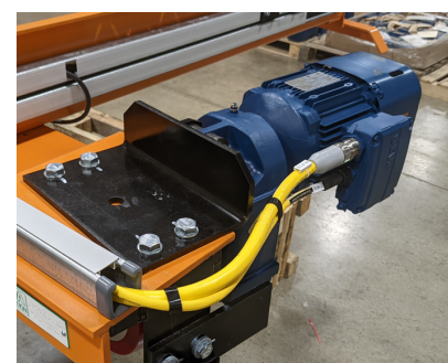
▲ Mounted turn table gearmotor.

One of the four wheels is powered directly by a gearmotor. The motor possesses a hollow shaft and torque supports, which are fastened to the cross beam via rubber buffers. The actual turn area is defined by the arrangement of the end stops and the attachment of the cam switch respectively.